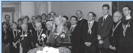
Milwaukee area residents memorialized the Virginia Tech shooting victims at City Hall on April 16