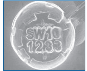
Example of a cartridge microstamped with specific information identifying the gun