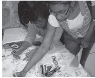
Students at Milwaukee Riverside High School personalized Journey for Justice shirts in memory of victims of gun violence.

One recent WAVE outreach activity was especially compelling. On March 25, we went to a health fair at Milwaukee Riverside High School to talk to students about their experiences with gun violence and to gather shirts for the Journey for Justice (front page).